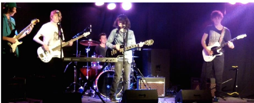
Second Year Band